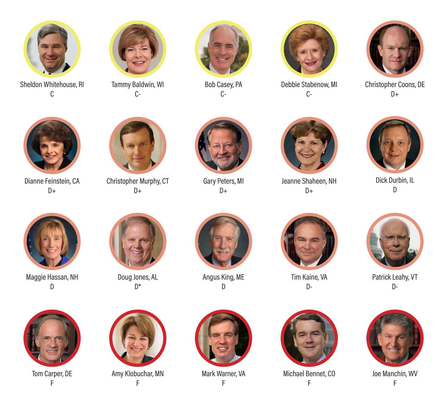
*Overall grade estimated from 2018 votes